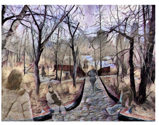
Reconnecting to Bow Afrin Islam