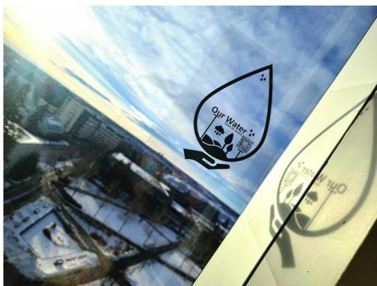
Pleasant Break Kulsum Fatima

SAPL students continue to rack up nominations at UCalgary's 2022-23 Images of Research Competition in the People's Choice category.