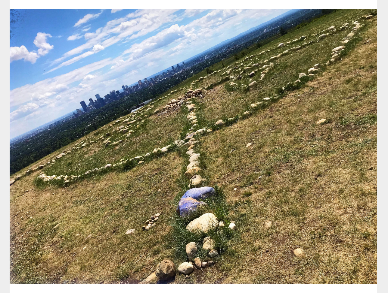
Indigenous Medicine Wheel at the top of Calgary's Nose Hill Park