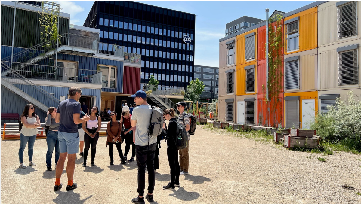
Students participating in the Zurich Study Abroad program visited FOGO, a temporary, mixed-use development where a housing and training centre for refugees shares space with start-up offices, artist workshops, a teaching and development kitchen and student housing.

UNIVERSITY OF CALGARY SCHOOL OF ARCHITECTURE, PLANNING AND LANDSCAPE