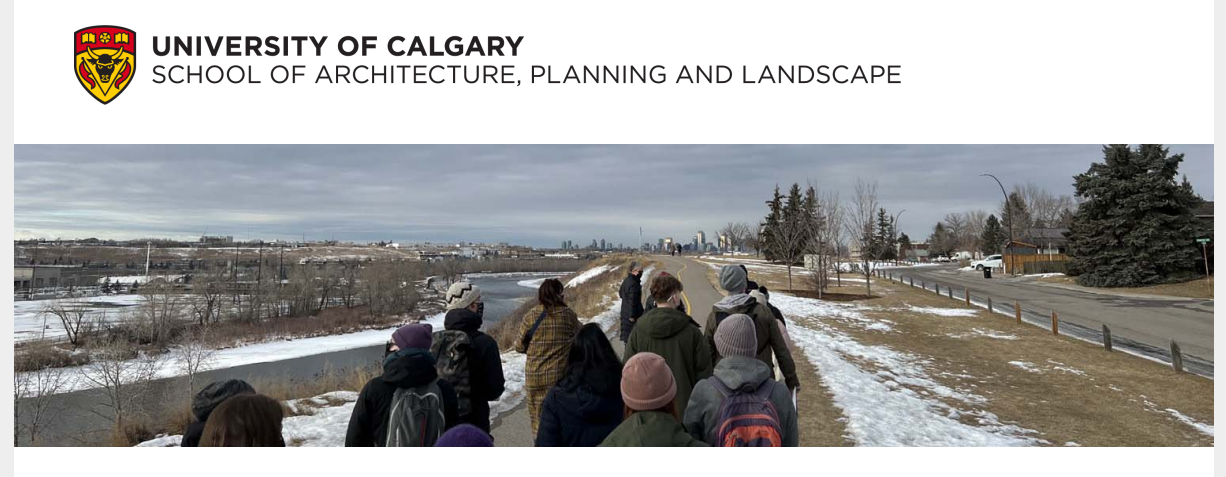
Image credit: SAPL planning students on a walking tour of the Millican-Ogden community in southeast Calgary. Image courtesy Francisco Alaniz Uribe.

Message not displaying properly? Try the web version.