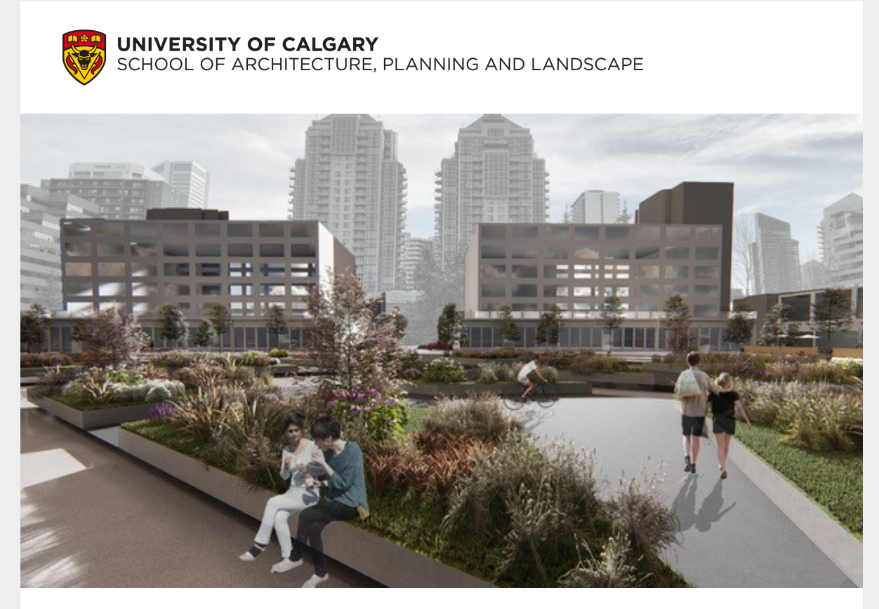
"Louise Crossing Proposal": a redevelopment of an empty parking lot in downtown Calgary. It aims to focus on native ecology through the inclusion of green roofs and geometric planters, supported by a rainwater collection system. The shapes of the planters reflect the design of West Eau Claire park and helps to better connect the two sites.

Message not displaying properly? Try the web version.