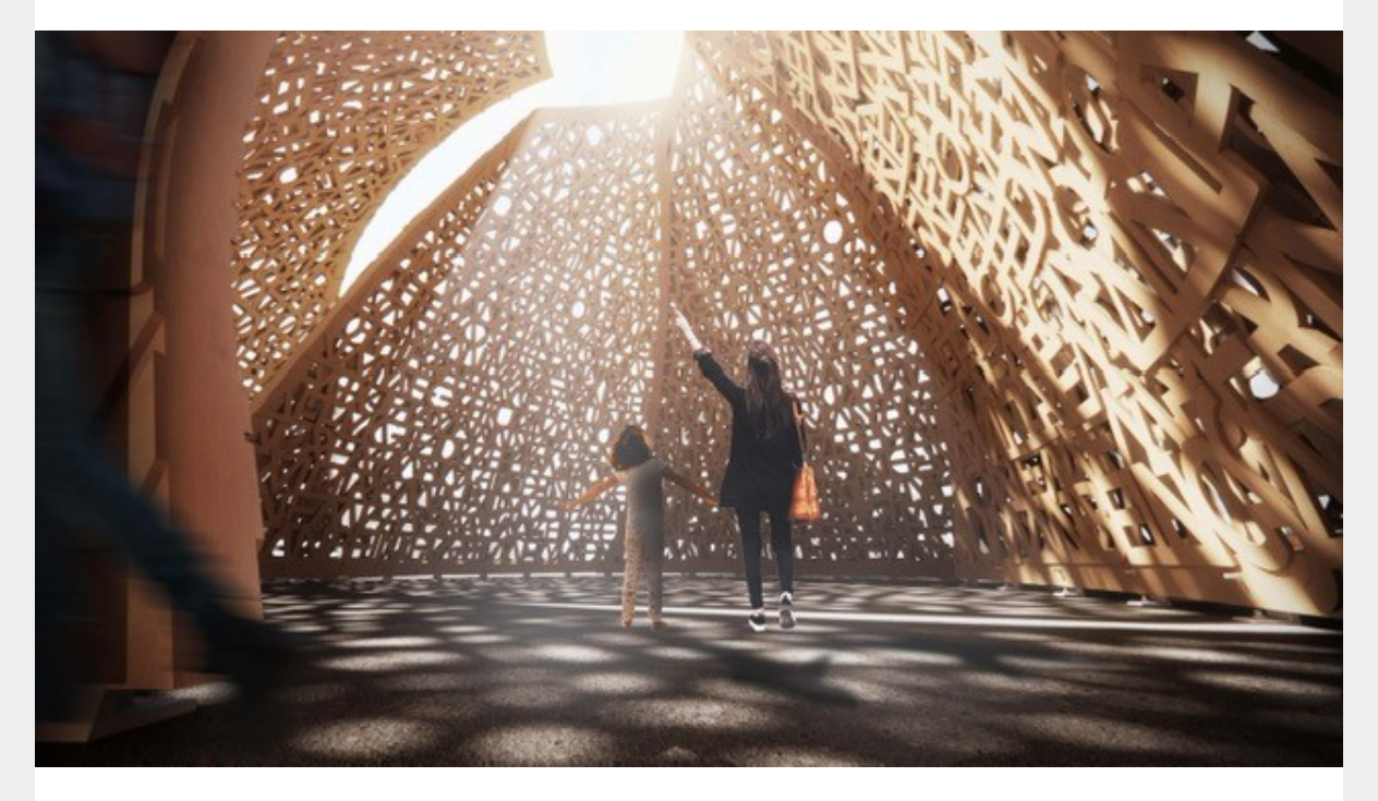
Image credit: Exciting work coming out of this term's Work-Integrated-Learning (WIL) Studios! Pavilion design by Jordan Livermore (MArch'22) from the Work Integrated Learning Studio led by Farhad Mortezaee.