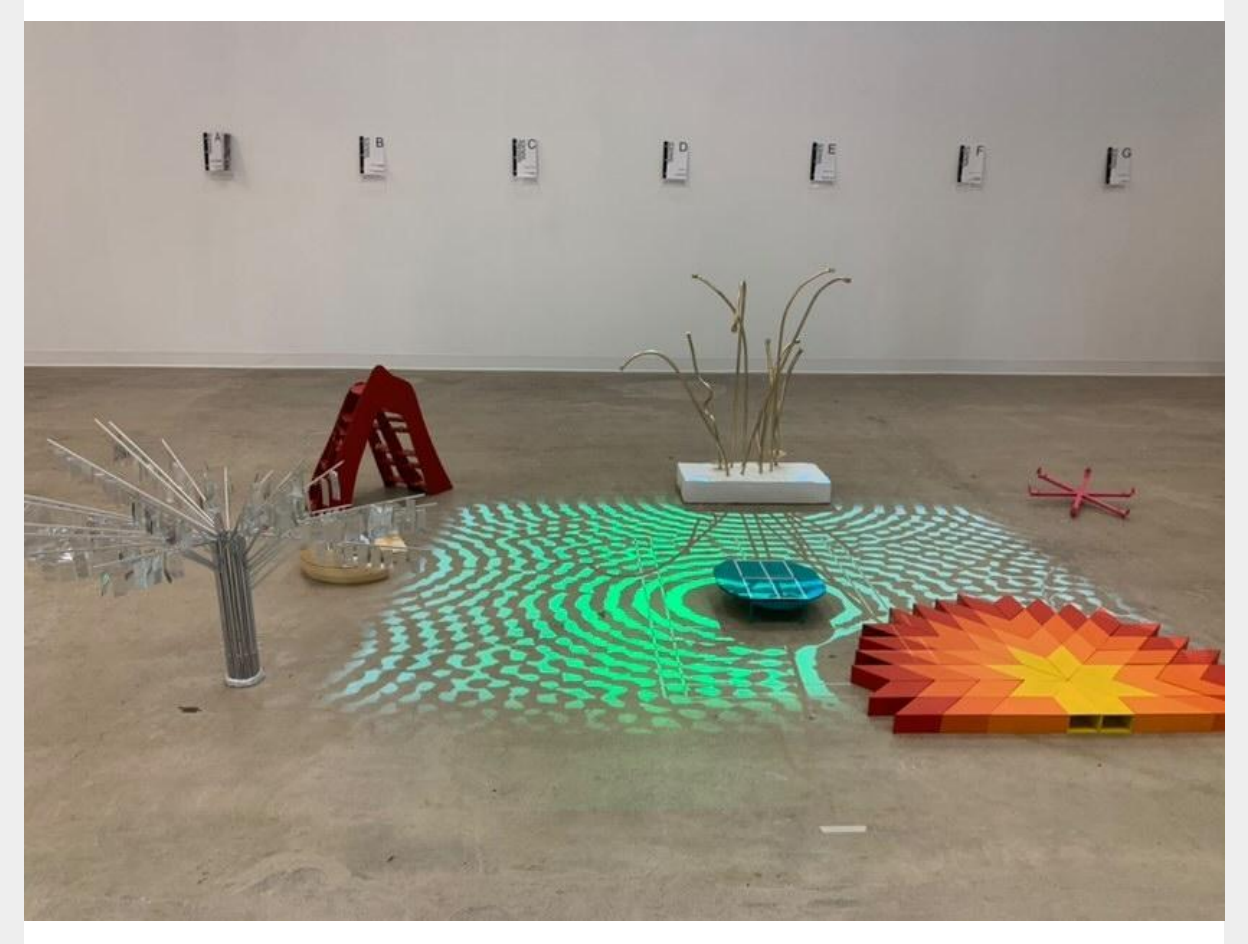
'Making Waves'